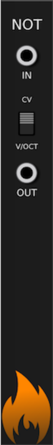
Figure 1: Not Image